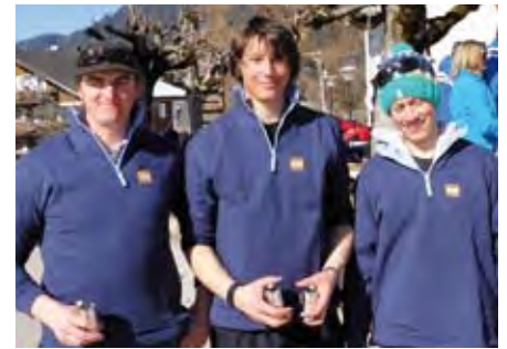
DHO prize winners (18-45 men)

the famous Kandahar races, since the Robert of Kandahar Challenge Cup was awarded there for the first time. By the way, on 3 April this year, a historic memorial race will take place in Crans Montana to celebrate the pioneering event of 1911 organised by the local World Cup Committee.