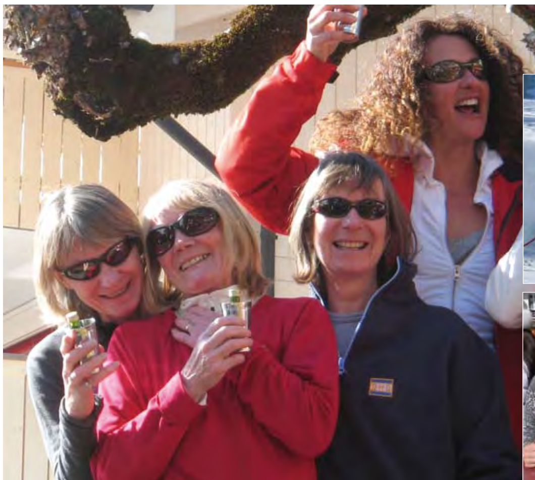
DHO ladies celebrations in full swing on the podium