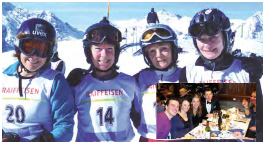
DHO Ladies (46-60) and (inset) celebrations at the Gala Dinner