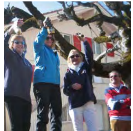
A DHO clean sweep