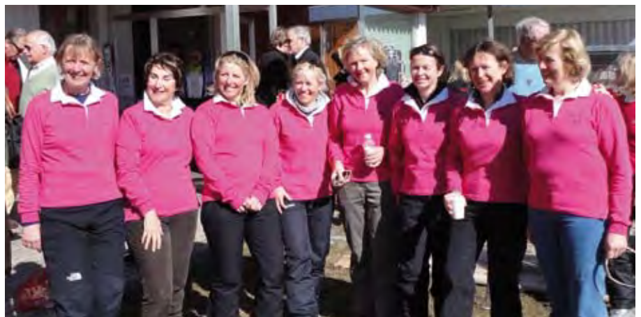
Ladies Ski Club Team