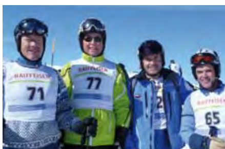
DHO men (46-60)

Everyone arrived back safely and early enough to enjoy a bit of Wengen village night life before a still early night prior to Sunday's Super G race.